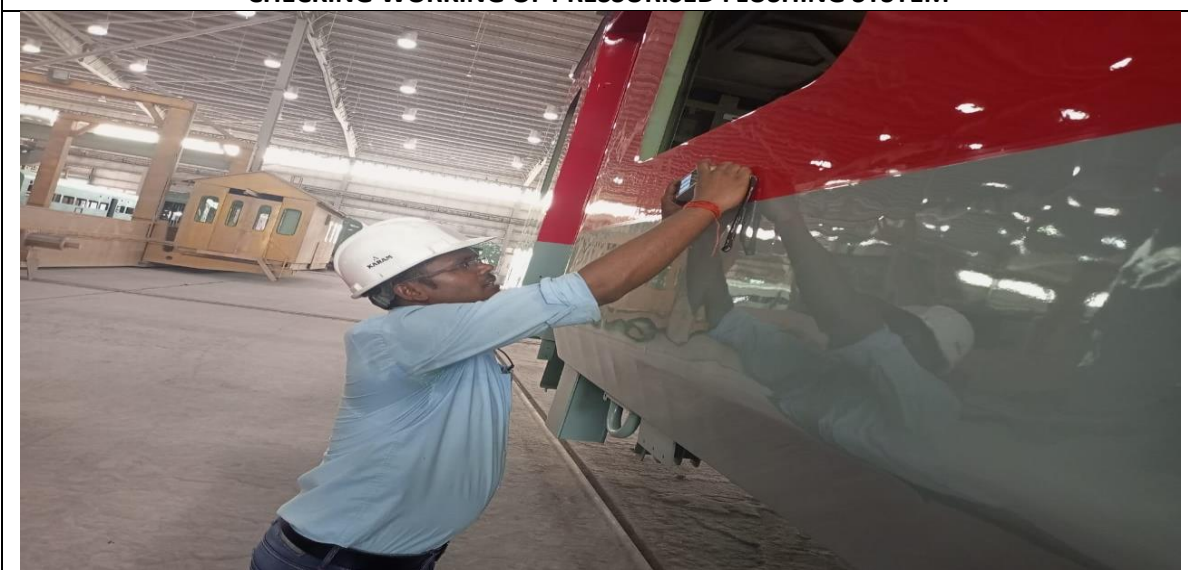
CHECKING GLOSS OF PAINT