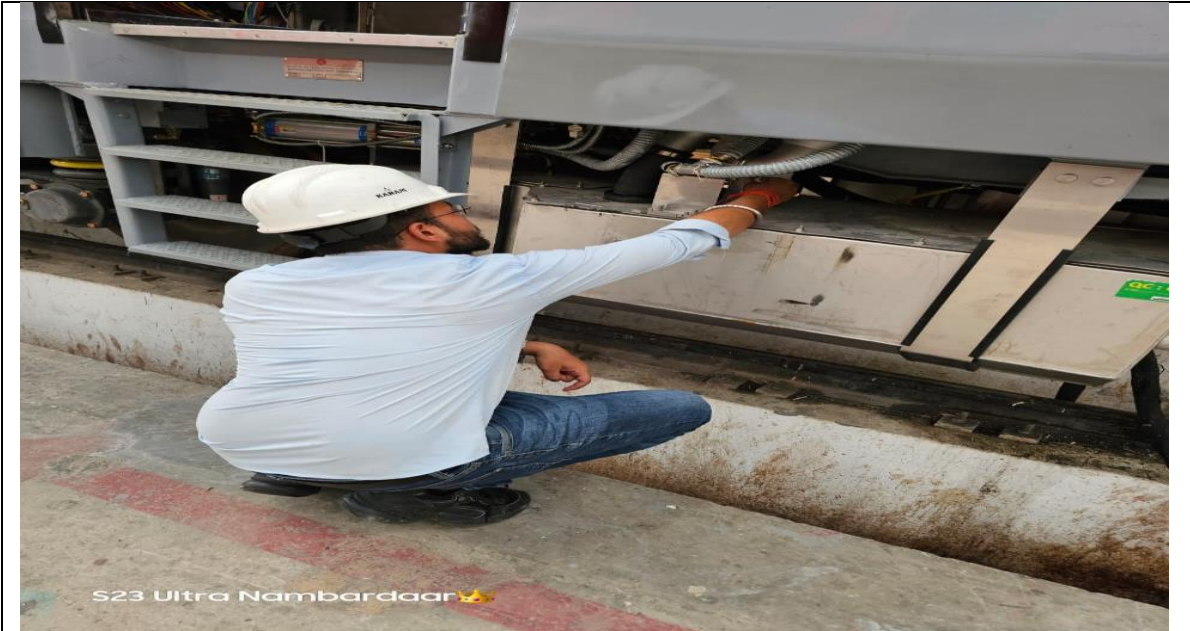
INSPECTION OF RETENTION TANK OF BIO TOILET