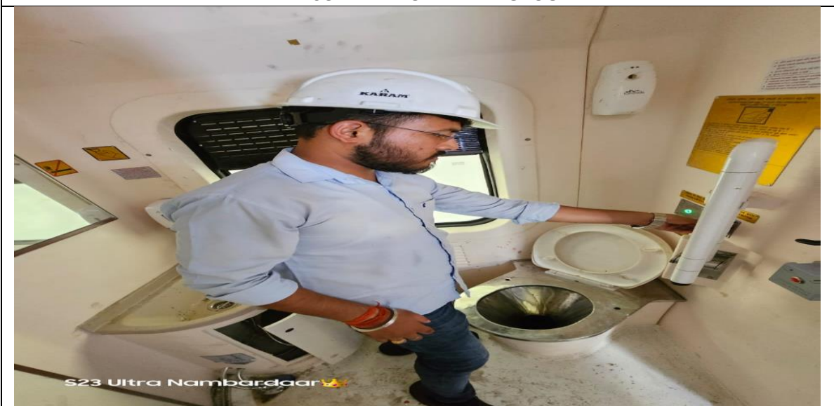
CHECKING WORKING OF PRESSURISED FLUSHING SYSTEM