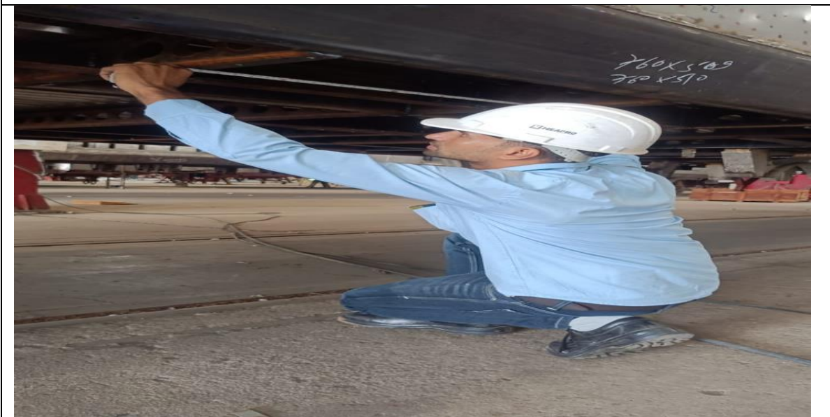
MEASUREMENT OF DIMENSION IN UNDER FRAME