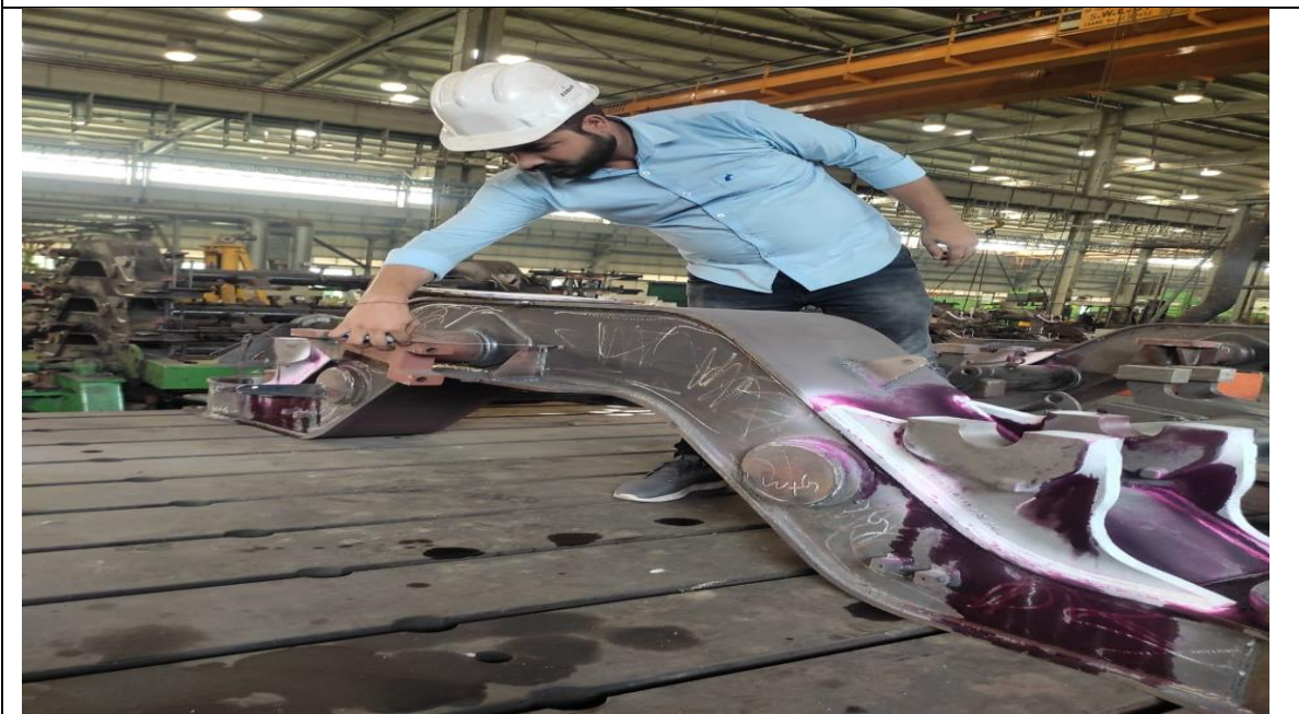
MEASUREMENT OF DIMENSION IN BOGIE FRAME