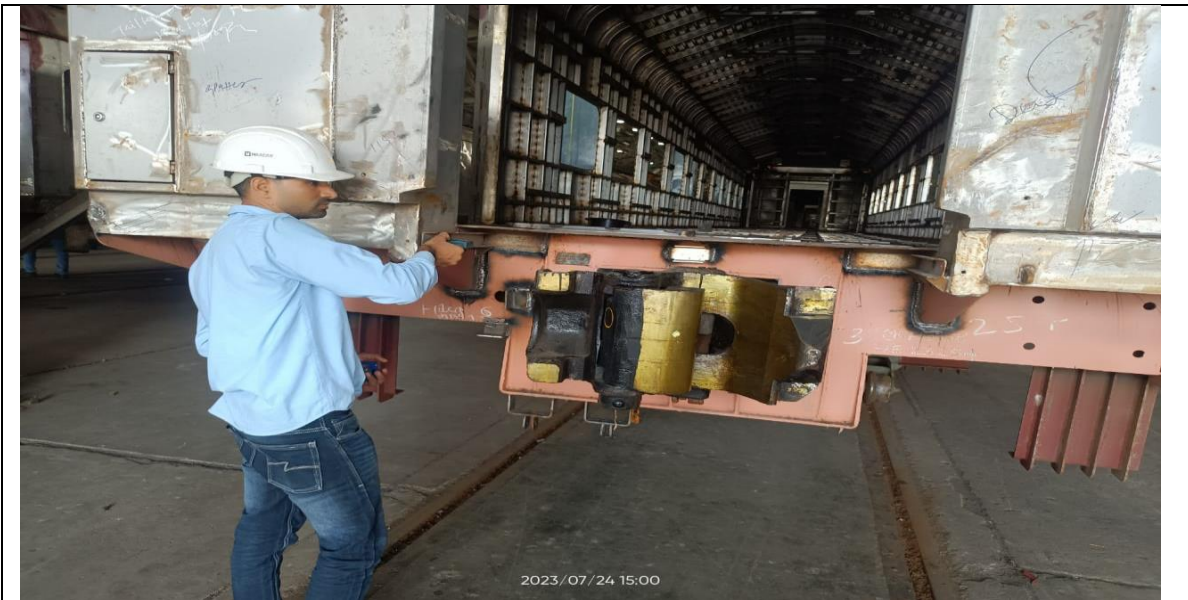
MEASUREMENT OF U CHANNEL BETWEEN DISTANCE