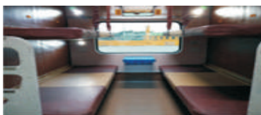
CCTV And Fire Smoke Detection System For Passenger Safety